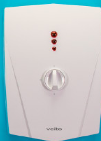
V1100 page 43