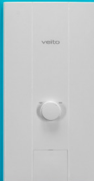
Blue page 33