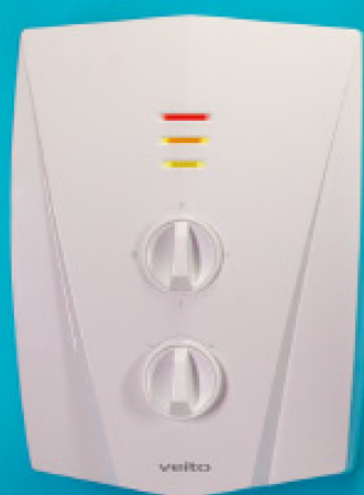
V1200 page 41