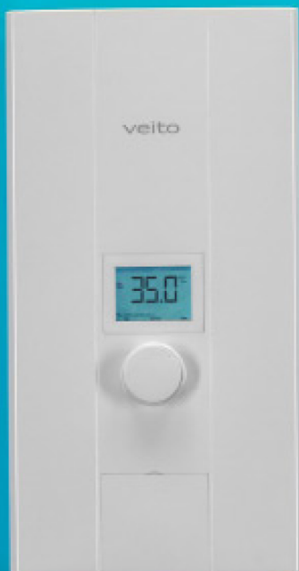
Blue S page 31