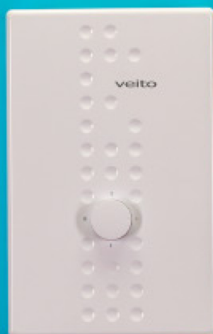
Flow S page 37